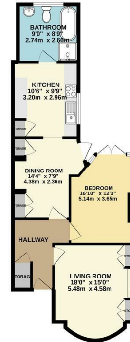
TOTAL FLOOR AREA: 840 sq.ft. (78.0 sq.m.) approx. While every attempt has been made to ensure the accuracy of the floorplan contained here, measurements of doors, windows, rooms and any other items are approximate and no responsibility is taken for any error, omission or mis-statement. This plan is for illustrative purposes only and should be used as such by any prospective purchaser. The services, systems and appliances shown have not been tested and no guarantee as to their operability or efficiency can be given. Made with Metropix ©2022

Property particulars as supplied by Anthony Webb Estate Agents are set out as a general outline in accordance with the Property Misdescriptions Act (1991) only for the guidance of intending purchasers of lessees, and do not constitute any part of an offer or contract. Details are given without any responsibility, and any intending purchasers, lessees or third parties should not rely on them as inspection or otherwise as to the correctness of each of them. We have not carried out a structural survey and the services, appliances and specific fittings have not been tested. All photographs, measurements, floor plans and distances referred to are given as a guide only and should not be relied upon for the purchase of carpets or any other fixtures statements or representations of fact, but must satisfy themselves by or of fittings, gardens, roof terraces, balconies and communal gardens as well as tenure and lease details cannot have their accuracy guaranteed for intending purchasers. Lease details, service ground rent (where applicable) are given as a guide only and should be checked and confirmed by your solicitor prior to exchange of contracts. No person in the employment of Anthony Webb has any authority to make any representation or warranty whatever in relation to this property.